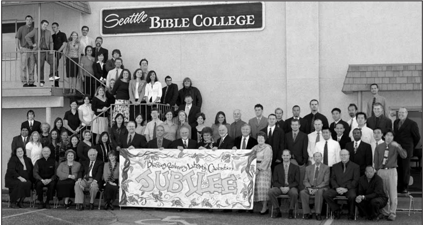
"Students, faculty and staff gathered for the camera in September with their newly dedicated "Year of Jubilee" poster.